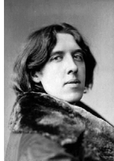
Oscar Fingal O'Flahertie Wills Wilde

The World , 25 May 1887, as "Lady Alroy".