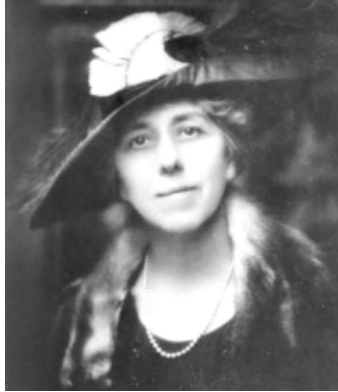
Alice Caldwell Hegan Rice

Best known as author of "Mrs. Wiggs of the Cabbage Patch". The Cabbage Patch was not some rural garden, as you might expect, but a Sunday school in a slum in Louisville, Kentucky, where Mrs Rice was a teacher.