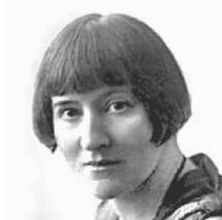
Ethel Lina White

A very early story, before she began writing such thriller novels as "The Lady Vanishes"